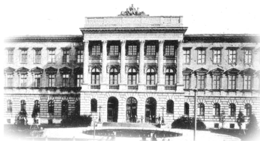
Lviv Polytechnic National University Main Building

Lviv Polytechnic National University Students' and PhD Students' Union and Self-government Young Scientists' Council